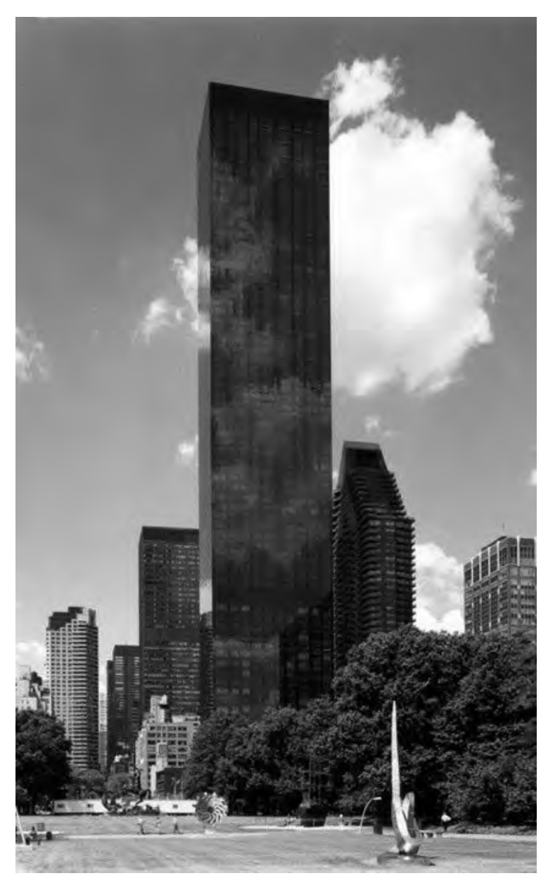
Trump World Tower at United Nations Plaza