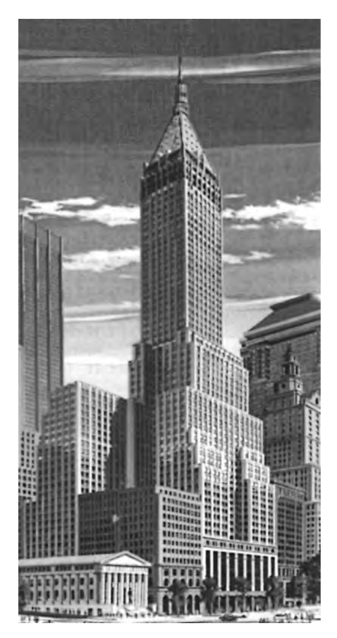
40 Wall Street