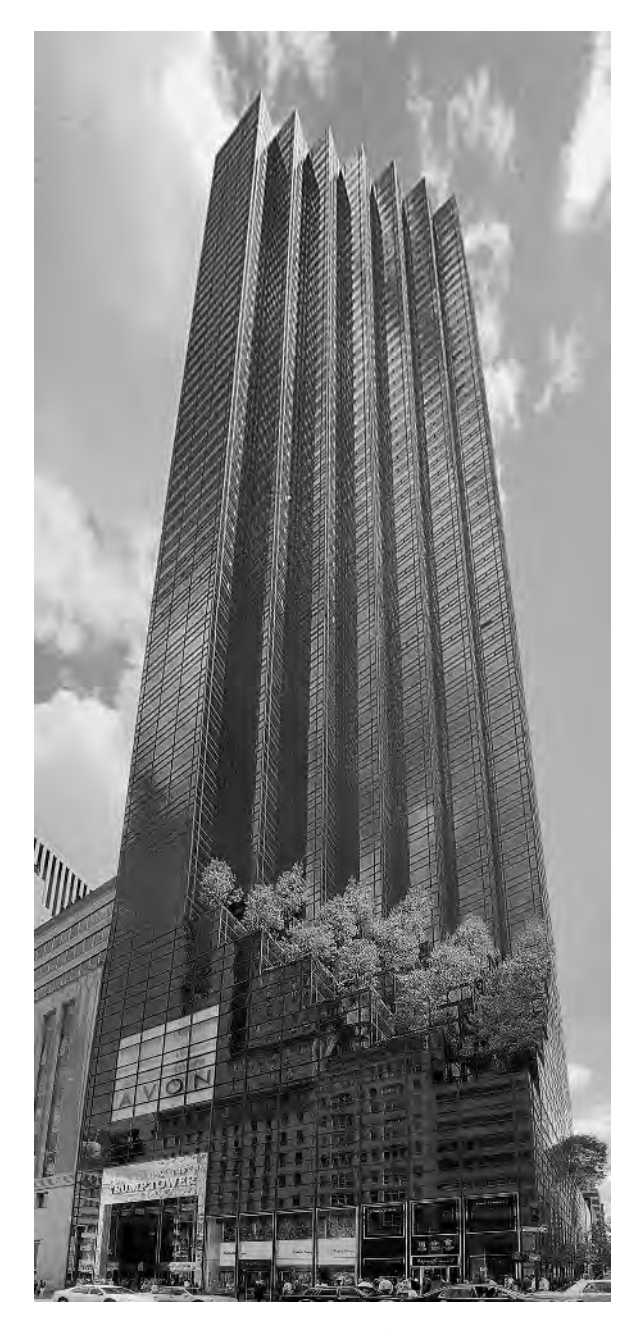
Trump Tower on 5th Avenue