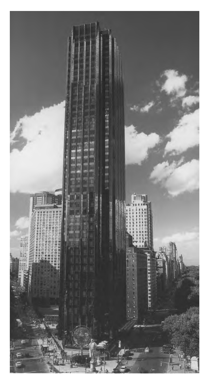
Trump International Hotel and Tower